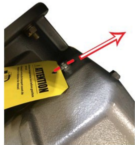
REMOVE plug, discard.

NOTE: The purpose of the motor plug(s) is to prevent oil leakage during storage/transport. Once the plug is removed, the built-in vent valve is active, and no further action is required.