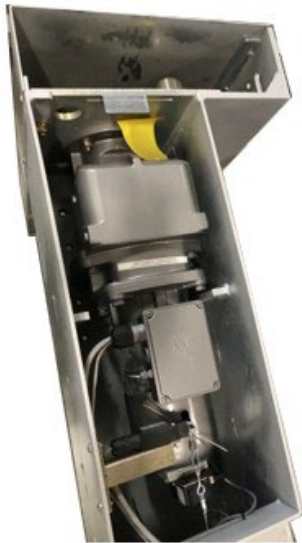
Take Off doors/top cover to access motor.