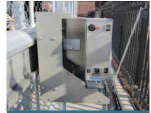
HEAVY DUTY CHASSIS